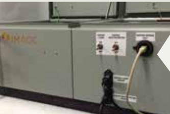
DFGA has the ability to run FTIR, Raman, or FTIR and Raman.